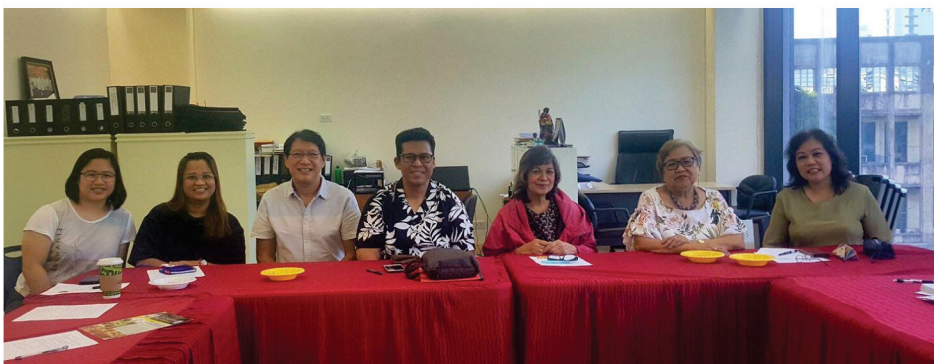
USTAAl Alumni Associations PRO preliminary meeting, July 13, 2019