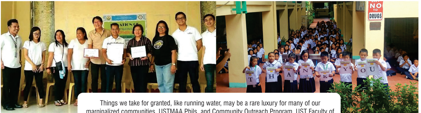
Things we take for granted, like running water, may be a rare luxury for many of our marginalized communities. USTMAA Phils, and Community Outreach Program, UST Faculty of Medicine and Surgery's SesquiCentennial Celebrations, under the Anargyroi Foundation, Inc, Turnover Ceremony of our mobile wash sink to the North Bay Elementary School, Navotas.