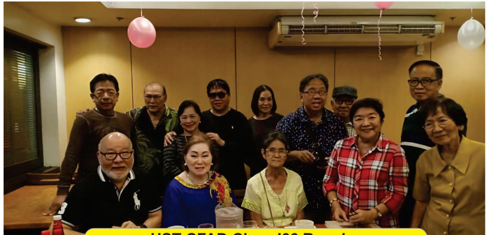
UST CFAD Class '66 Reunion