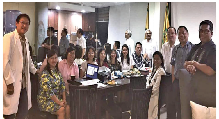
UST MEDICINE ALUMNI ASSOCIATION BOARD MEETING