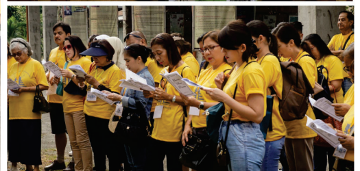
Thomsonian Alumni Pilgrimage 2019