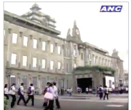
UST Featured on ANC Travel Time https://youtu.be/fCwSzu7o1jY