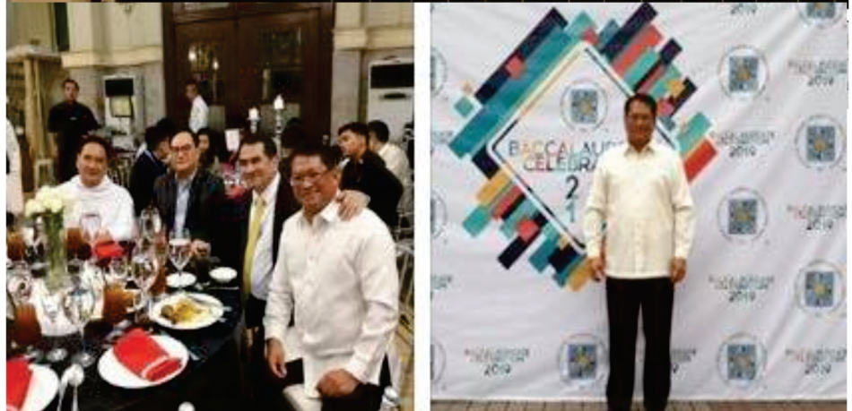
UST Faculty of Civil Law Baccalaureate Dinner 2019