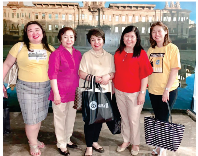
Our very own from the Faculty of Pharmacy from Bicol