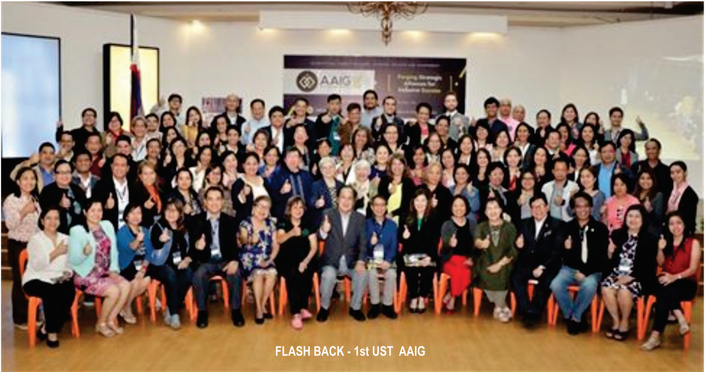
FLASH BACK - 1st UST AAIG