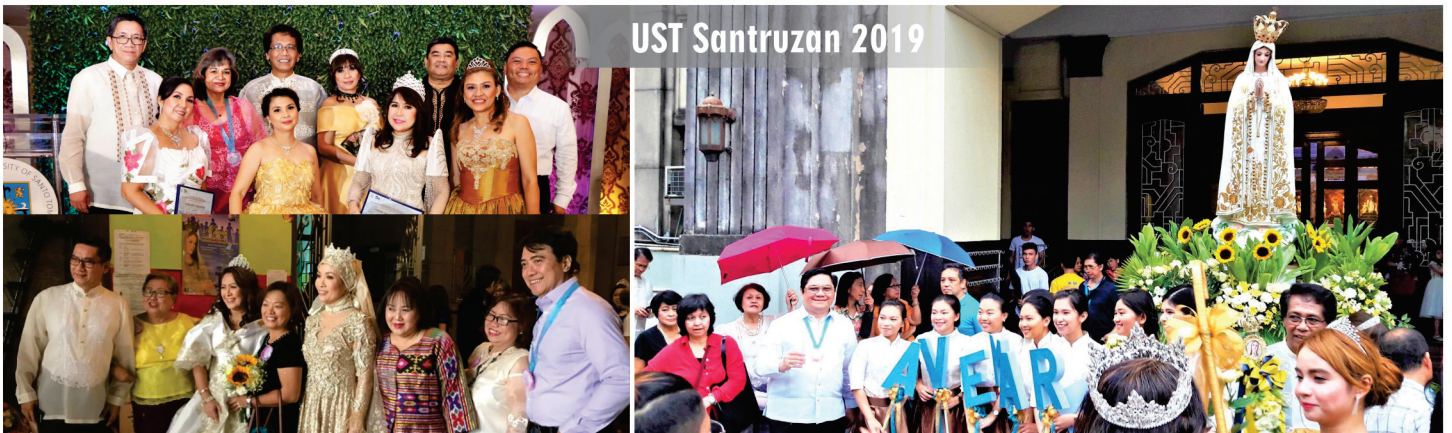
UST Santruzan 2019