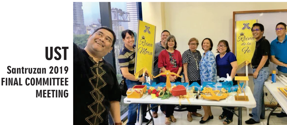
UST Santruzan 2019 FINAL COMMITTEE MEETING