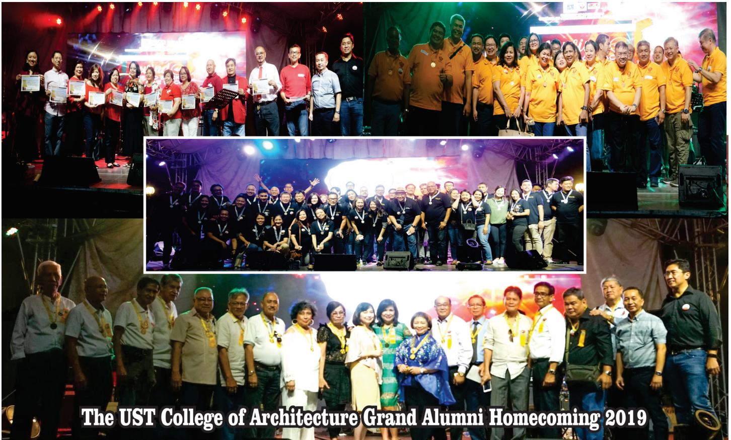
The UST College of Architecture Grand Alumni Homecoming 2019